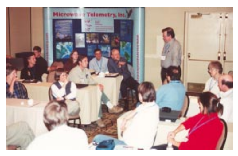
Presentations, round table discussions, networking during breaks, and conversation over lunch gave biologists and veterinarians opportunities to talk shop and to trade ideas and methods.