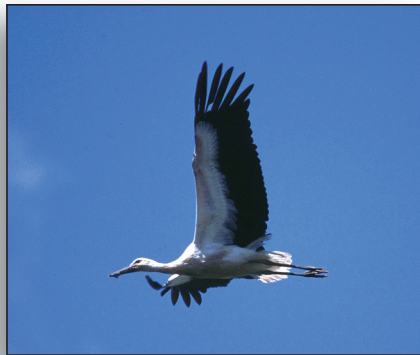
Max on one of her first flights after fledging at 9 weeks old.

During her journeys Max's movements were followed daily by several thousand people: her migration was published on the Internet and maps were regularly updated. All newspapers and other media in Switzerland and even many newspapers elsewhere