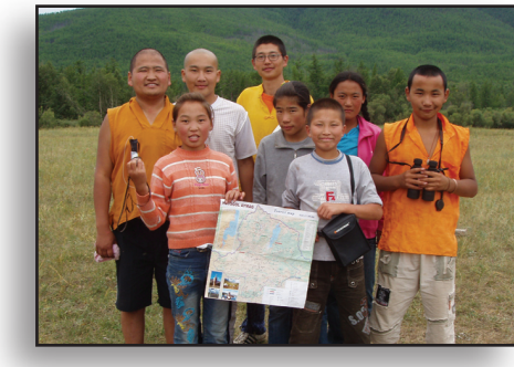
EcoClub students and Buddhist monks (in yellow) from a local temple. At a summer camp arranged by the non-profit TCF, we play games to introduce children to methods of wildlife research, including GPS, map-reading, and telemetry.

We hope that the children will continue to share their enthusiasm about birds, and particularly Great Bustards, with their parents and communities.