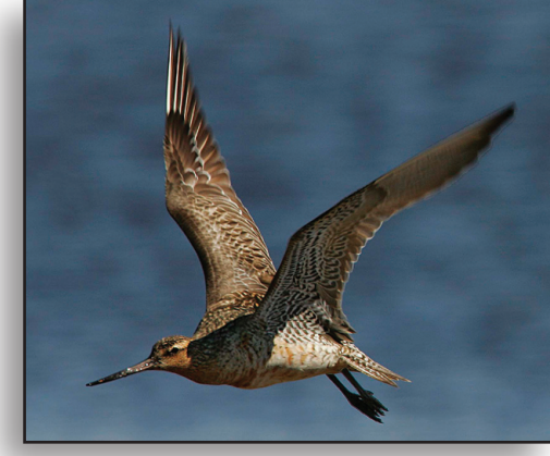
Male Bar-tailed Godwit in Alaska in May.

to New Zealand and eastern Australia. The bird (dubbed 'E7' after the code on her leg flag) had just been tracked on a non-stop, 8-day-long flight south across the