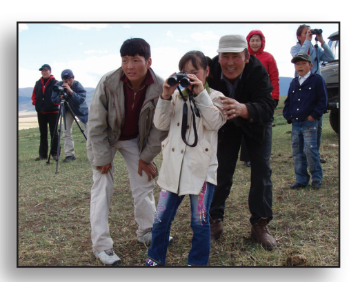
Students run to the binoculars and spotting scopes. We have designed curricula on bird identification, bird ecology and conservation for local schools.