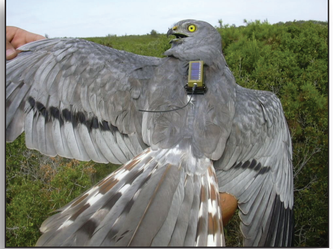
An adult male Montagu's Harrier equipped with a 9.5g solar powered PTT.

migration from the breeding grounds in Eastern Spain to Western Africa, three males and three females. For one of these no data were obtained during the migration (we only have locations in the breeding and wintering grounds). The other four either died or the transmitter failed, two before starting the migration and two during. Hence, only five individuals were tracked throughout the whole migration. The harriers