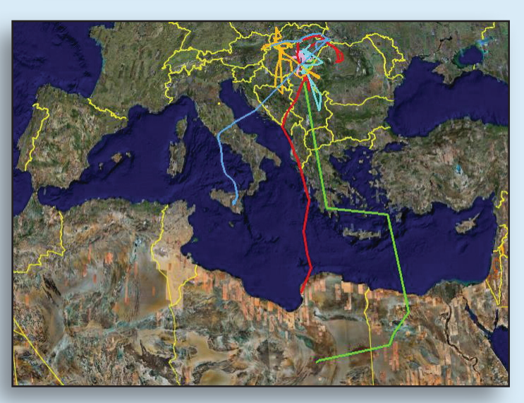
Movements of falcons: Green-Emese; Blue-Barna; Red-Viki; others stayed at home.