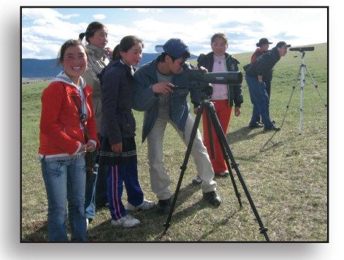
Using the 70g Argos/GPS PTTs, our team is collecting information important for conservation, including habitat use patterns, critical habitat, and migration routes.