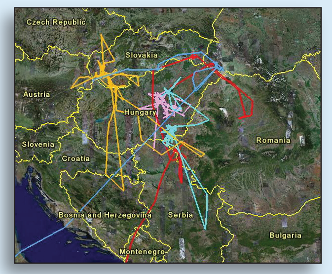
Map shows movements of GPS PTT falcons within the Carpathian Basin