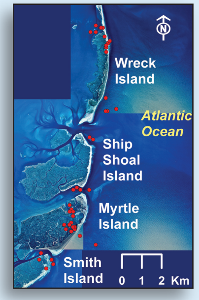
Tagged Red Knot locations over a three month period, June to August 2007. Only LC3 locations shown.

The activity counter sensed a lack of activity and ceased to increment in late August, we lost the signal soon thereafter. However, the bird had ranged over 36 miles of shoreline during the time we tracked it, and the battery appeared to be fully charged at the start of each cycle. The map shows only the LC3 grade fixes obtained over the approximately 3 month period that the bird was tracked. This appears to be a successful step in the