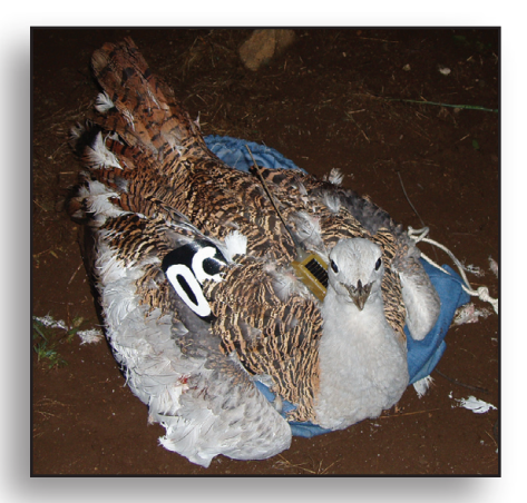
We succeeded in harnessing three Great Bustards with Argos/GPS PTTs. These birds are beginning their migration and one individual has already migrated south over 1700 km.