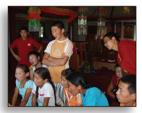
TCF's summer camp takes place at a Buddhist temple where a monk and young monks-in-training are resident in the summer. In addition to lessons on ecology and outdoor activities, schoolchildren attend religious services and lectures about Buddhism as part of an effort to revive traditional conservation values.