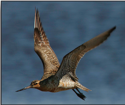
Male Bar-tailed Godwit in Alaska in May.

On 7 September 2007 an international group of scientists and shore-bird enthusiasts eagerly awaited transmission from a PTT deployed on an adult female Bar-tailed Godwit Limosa lapponica baueri , a large shorebird that nests in Alaska and migrates to New Zealand and eastern Australia. The bird (dubbed 'E7' after the code on her leg flag) had just been tracked on a non-stop, 8-day-long flight south across the