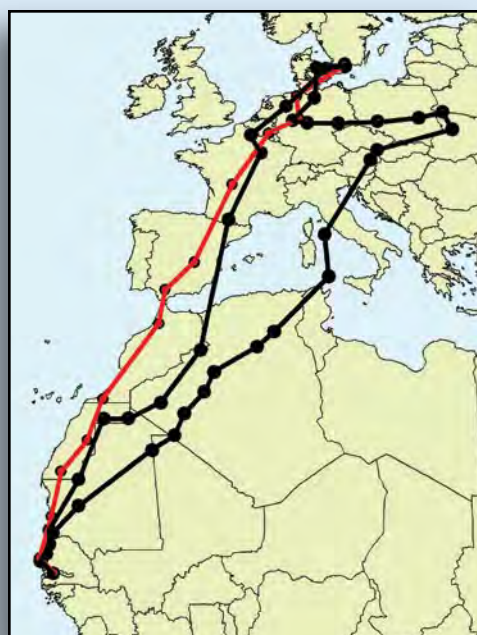
Map showing the male Marsh Harriers' migration routes from Sweden to Senegal. The red track represents spring migration.

As a new graduate you need plans for the future to keep your research going. The most important and challenging goal for my future studies of raptor migration will be to track juveniles from their first naïve journeys until they are migrating as experienced adults. This would give a better understanding of the relative importance of genetics versus learning for the birds' migration patterns and strategies.