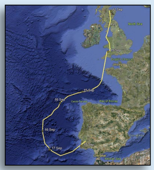
Osprey SSK's dramatic 3000 km 60 hour migration

Following satellite-tagged birds as they set off on their autumn migration, we soon saw that experienced adults, when leaving Scotland, flew south through the British Isles and crossed the English Channel into mainland Europe, while more young birds than expected headed west of south and into great danger. One of the earliest chicks we tagged, the first to demonstrate the dangers of long-distance flights over oceans, flew to Ireland to find itself faced with a 1000 km direct flight over the Atlantic to northern Spain. Another chick ran into a low pressure system south of the British Isles, was carried out over the Atlantic and finally blown ashore in Portugal after an epic 60 hour, 3000 km non-stop flight over the sea (see map). And these chicks had only been flying for six weeks. The first made it safely to Africa, while the other stayed in Portugal and was found nesting in Scotland three years later. A few