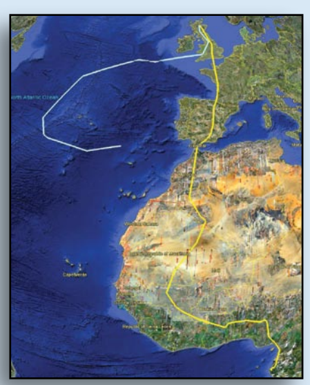
Male honey buzzard's track (yellow) from Scotland to Gabon; tragic migration of juvenile -6000 km in 108 hours before dying in the North Atlantic.

short sea crossing to France and continue safely to Gabon. His chick, meanwhile, headed off down the western side of the UK and was swept out by easterly winds into the open Atlantic. Flying the wrong side of the Azores, he was blown south-east towards Madeira but landed in the sea well short of the island and died. It had been a 108 hour, 6000 km non-stop journey over the ocean, an incredible but hopeless flight. But we now know they regularly cross the Bay of Biscay.