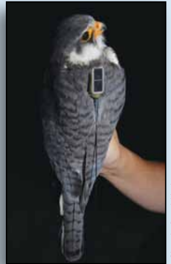
Adult female Amur Falcon, January 2010.

In a joint effort the World Working Group on Birds of Prey (WWGBP), Microwave Telemetry, Inc., BirdLife Northern Natal and the Migrating Kestrel Group of the Endangered Wildlife Trust in South Africa started a satellite tracking program to study the almost unknown migration routes and other aspects of the biology of this little known raptor species. Ten adult birds were fitted with 5g PTTs in Natal, South Africa. Five falcons were tracked up to their breeding grounds in north-eastern China on their 14,500 km trip. In one case, almost 6,000 km were covered non-stop in five days, indeed an extreme endurance migration.