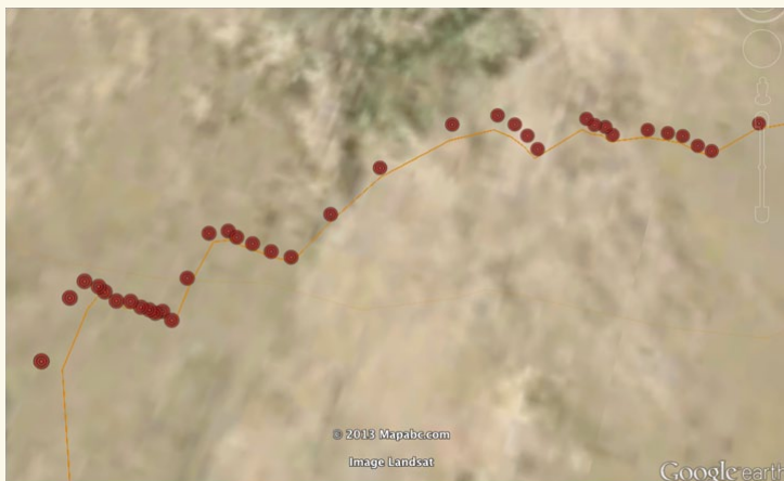
Flight strategies illustrated by Chinggis. Spacing between points is indicative of thermal soaring.

migration of over 2000 km began, and a painting became a sculpture. Chinggis represents the first success of a project that began in 2011 and continues to this day. Since then, two additional Pallas's Fish Eagles with 70g GSM/GPS transmitters were released in India, and five more will be deployed in Mongolia the summer of 2015 thanks to the generous support of Microwave Telemetry, Inc. with the Christiane Howey Rising Scholar Award. The overall goal of the project is to provide baseline information that will shed light on Pallas's Fish Eagle ecology by isolating risks to the population and creating effective conservation measures in the future. If the current gap in knowledge remains, there is a distinct possibility that, one day, Mongolia's Pallas's Fish Eagle population will fly away and never return.