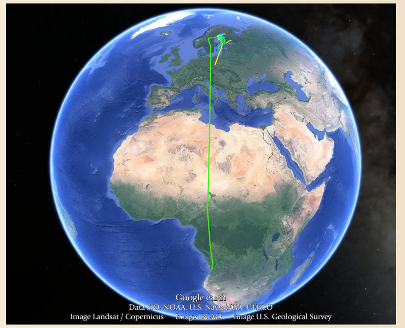
Migration route of young cuckoo travelling from Finland to wintering grounds in Angola.

With tagged young cuckoos raised by redstarts in nest boxes in Finland, we were finally able to track one young all the way to the wintering grounds in Angola, where also many adults spend the winter! Interestingly, the young were travelling on a different route from the breeding grounds, first travelling southwest from Finland, involving extensive sea-crossings, to a prolonged stopover, and then changing route to travel straight south to the wintering site. It seemed clear that the young were not following experienced conspecifics.