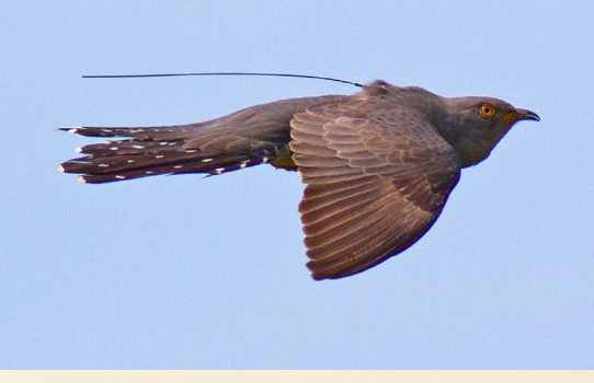
Tagged cuckoo in flight.

South Scandinavian cuckoos, flexible navigational response after displacement, and differences in mortality along different routes. While we tracked the migration patterns in adult cuckoos, we also initiated an effort to track the migrations of the young on their first migration through the MATCH project. Would they really travel on their