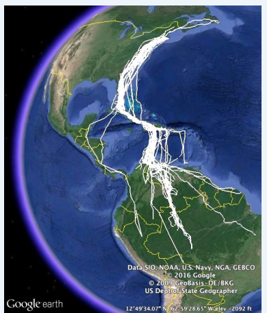
Figure I. Southward migration routes of adult Ospreys.

From 2004 through 2016, my collaborators and I have outfitted 56 young Ospreys with Microwave Telemetry's 22g and 30g Solar Argos/GPS PTTs from South Carolina to the eastern edge of the North American continent