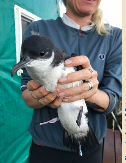
A Newell's Shearwater chick at Upper

We are now finishing up our study, with the last cohort of birds currently flying away from Kaua'i and out over the deep blue sea. Once they have finished transmitting we will have all of the data we need to see how well the rehabilitated birds fare compared to their wild fledging counterparts, so more to come on this soon! The tracking work has also allowed us to get a better understanding of the first few months of the bird's lives at sea, revealing